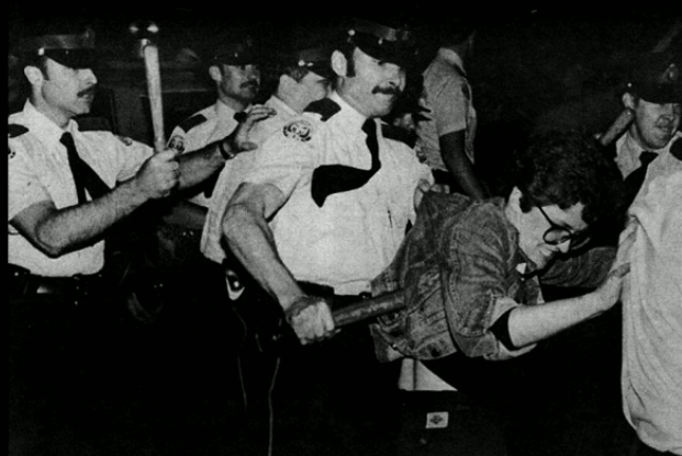
BATTLE ON CHURCH STREET. On Jun 20, 1981, police attacked a crowd of several hundred gay men and lesbians ...