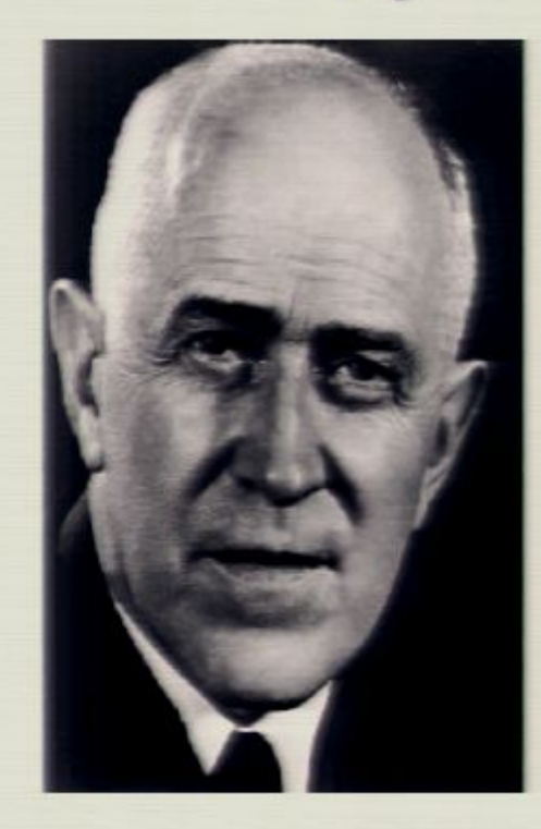
William Fielding Ogburn Social Change, 1922

"It would seem that the larger the equipment of material culture, the greater the number of inventions. The more there is to invent with, the greater will be the number of