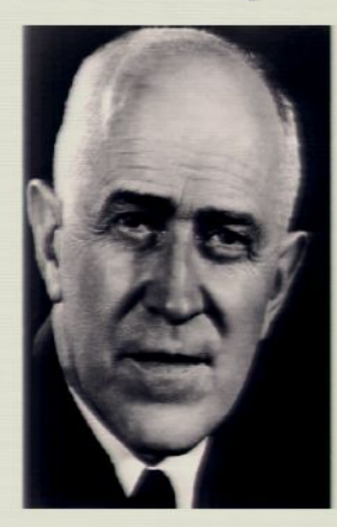
William Fielding Ogburn Social Change, 1922

"It would seem that the larger the equipment of material culture, the greater the number of inventions. The more there is to invent with, the greater will be the number of